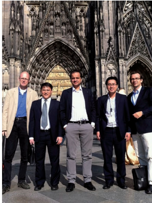
Two representatives from Austfeed visited Victam International in Germany in May 2011 as hosts of Addcon.